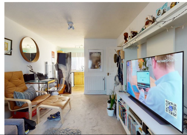
Flat 41, Barrington Court Winton